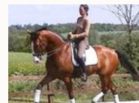
Learn how to use your seat and the lightest of aids.

How to get yourself into the best emotional condition to ride. How to create a confident you in the saddle, using proven NLP methods. Techniques to build rapport and connection with your horse. Creating a compelling future for you as a rider. Correct posture in the saddle. The effects of the aids applied on horses with different personality styles. Practical demonstration of the effects of poor seat, poor posture and the effects of the aids. Audience participation to correct the above and embed the learning. How to motivate horses with different personality styles and practical strategies to keep your own horse engaged.