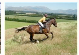
Achieve your goals and put the enjoyment back into riding