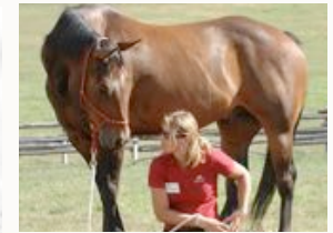
Learn how to communicate clearly with your horse