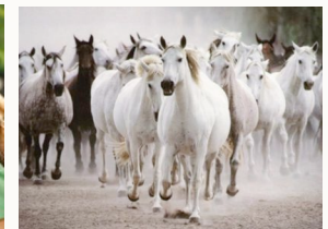
Understand the different personality styles of horses