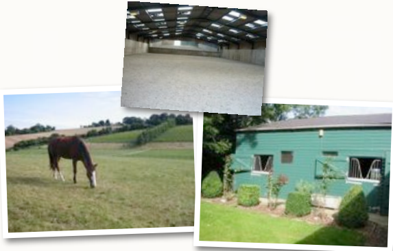
Our stunning venue nestles in the tranquil Kent countryside of the North Downs area of outstanding natural beauty.

Inspirational Riding Solutions has created a powerful and practical workshop aimed at anyone who wants to increase their knowledge and understanding of human versus equine psychology. Using proven techniques and strategies for both you and your equine partner, you will gain an in-depth knowledge of both minds, enabling you to improve your riding through effective communication, empathy and understanding, bringing enjoyment in whatever you do.