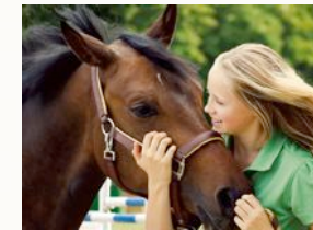
Discover what motivates your horse

Understanding your mindset and how it impacts on your horse. Understanding your own energy levels and how your horse responds. Self control and emotional management and how this helps your horse become more consistent. Personality styles for people. Viewing the world through the eyes of a horse. How you think your horse sees you and what he really thinks. Personality styles for horses and matching your style with a horses' style. Unlock the secrets to motivating your horse. Practical demonstration with audience participation.